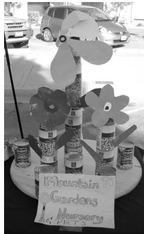
Mountain Garden Nursery