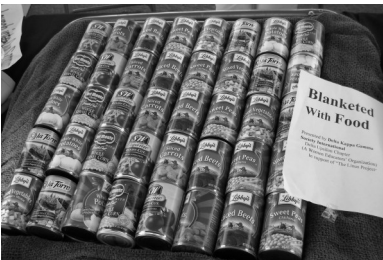
Delta Kappa Gamma Sorority International-Quilt