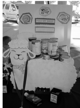
Feed My Sheep